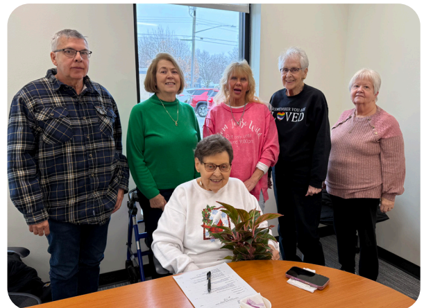
Above: The Rambling River Center Advisory Board planned decided to be open as a warming center for the Holiday Lighted Parade. They along with our members volunteered to served hot cider, cookies, give tours. We are grateful to those that brought homemade treats and helped with the event!