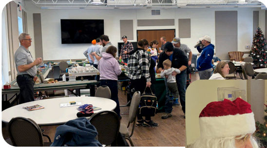
Above: The Model Railroad Club conducts the trains at the Trains and Treats Event.

Special thanks to all the volunteers that made the holiday season so special for our community and each other! Old and young alike enjoys Trains and Treats, our decorated windows, Secret Holiday Shop, and the treats and cider with our Advisory Board and members at the 2nd annual Holiday Lighted Parade. We appreciate you!