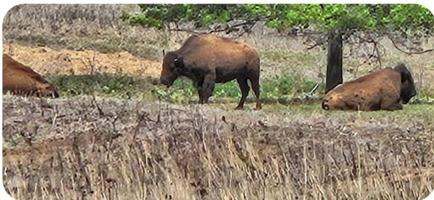
The biking club, who also walk or cross-country ski, has been on some rides with awesome views. This photo is from Spring Lake Reserve.