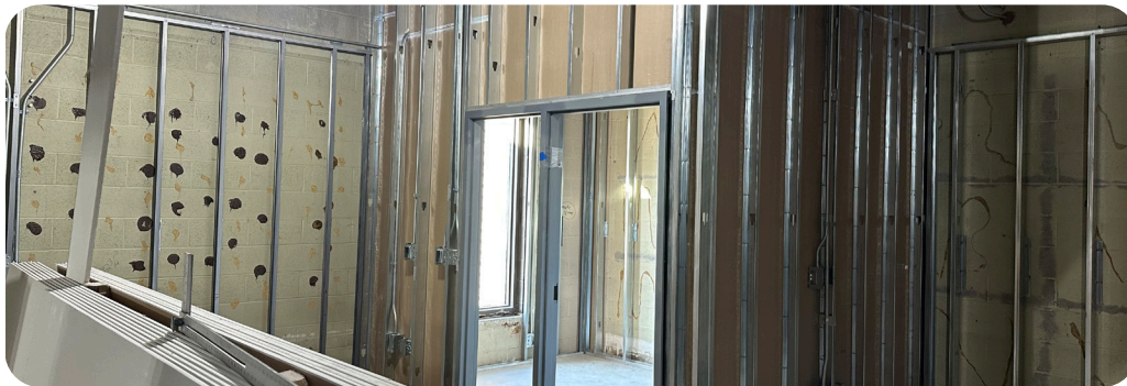
The former fitness room now the Rotary Lounge and Stacey Office.