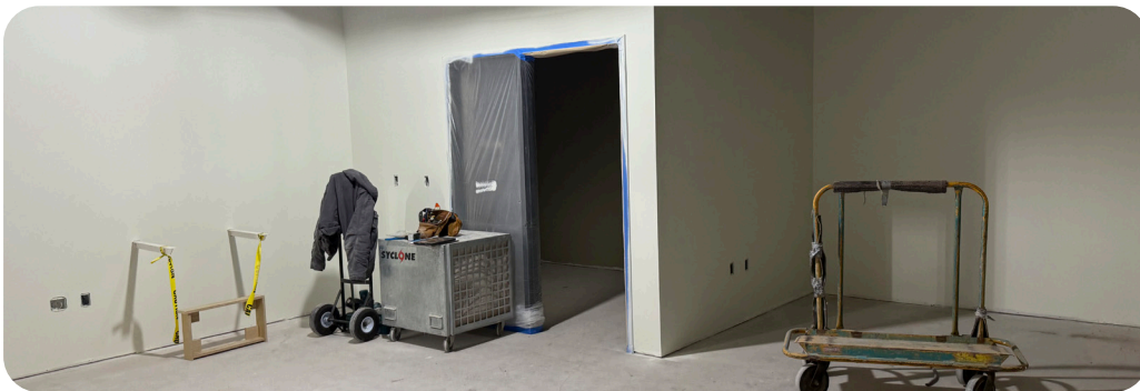
The former fitness room now the Rotary Lounge and Stacey Office.