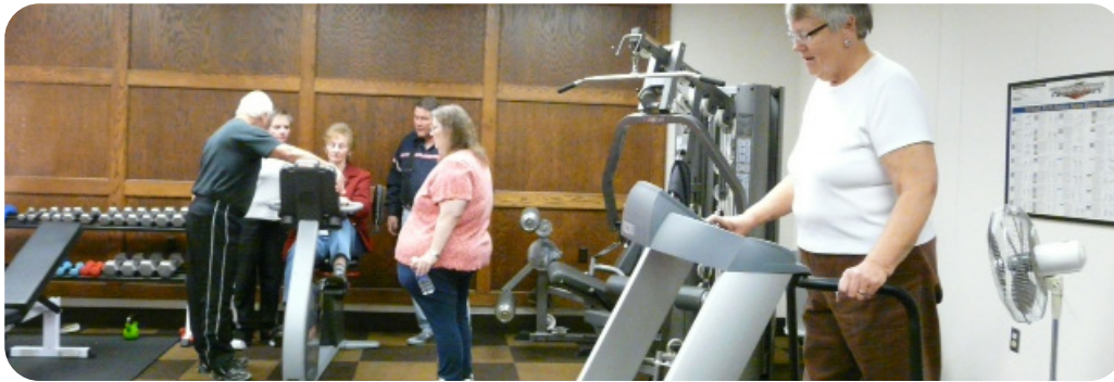
The former fitness room.

We do plan tentatively to re-open the building on June 2 at 7:30 am. Stay tuned for updates. Please follow the schedule as listed on pages 8-9 of this publication.