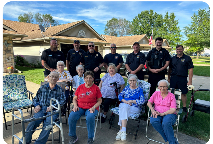
Police, Fire and Mayor Hoyt visit neighbors on National Night Out 2024.

This year we will continue the tradition of collecting items for the Farmington Food Shelf. Let's see how many pounds of donations we can get! Find the food shelf's most needed food, personal care, and cleaning items at FarmingtonMN.gov/FoodShelf .