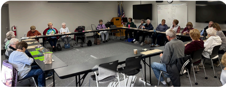
Join us for Bingo, Friday mornings at 10:30 am.

Remodeling Sale Greeting Cards. 2 for $1